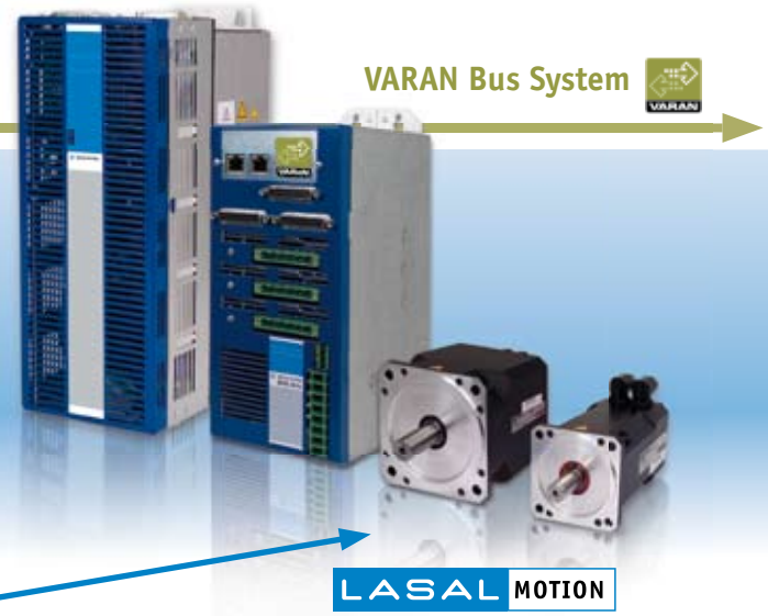
VARAN Bus System

With the Motion Control System, SIGMATEK offers complete motion control solutions: motors, drives and software interact seamlessly and are fully integrated into the control system. The convincing result is simple start-up, excellent servo properties, high precision, flexibility and efficiency.